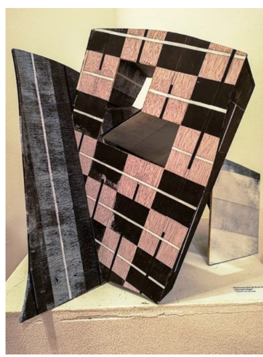
Cheonae Kim & Kurt Steger, "Day and Night," Pencil on Wood

running through and across the surfaces. "The Road to Serfdom-F. Hayek #1 + #2" and their mixed-media panel, "Made-in-China Is Over" comprised of garments, shipping materials and chains, all make strong statements.